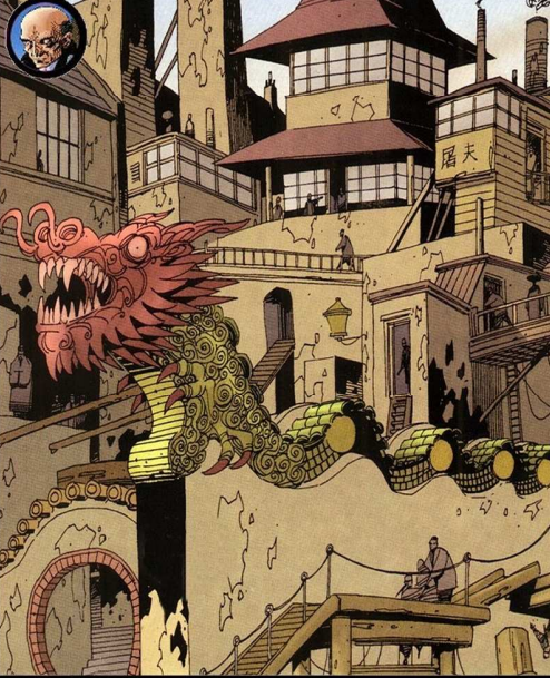
F4 Shanghai Charlie Opium Den